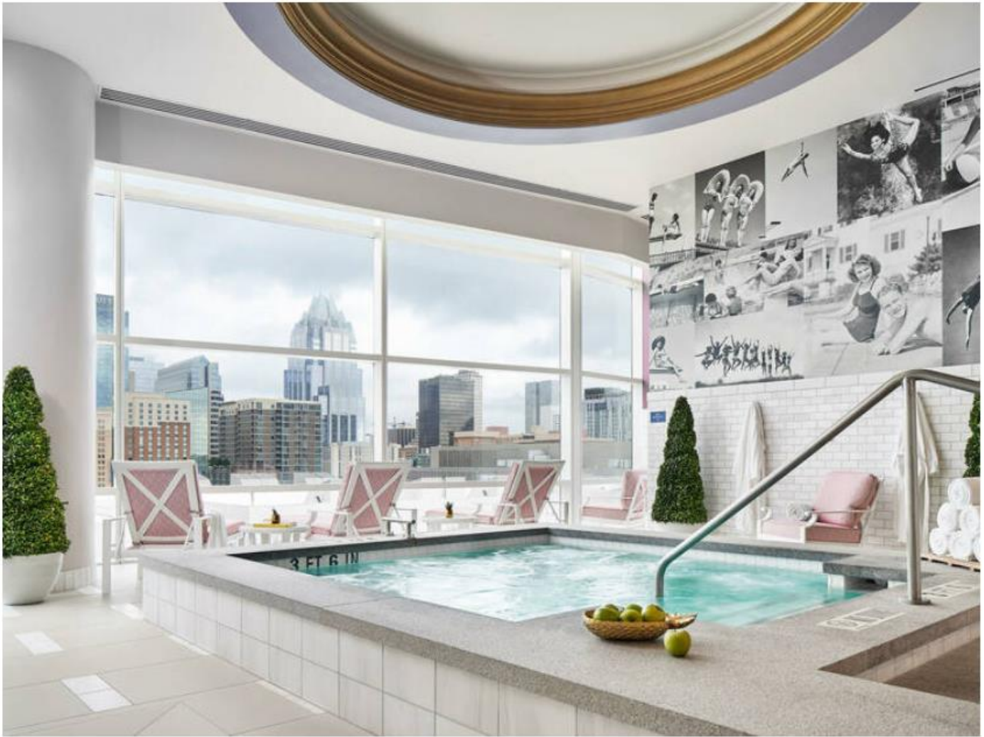
Photograph: Courtesy Fairmont Austin