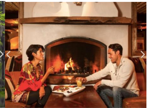
Share the love with a city you'll soon far head over heels for: Santa Fe, New Mexico.