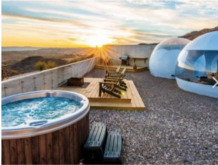
Pig span some bubbly in Blossoms' Tegu's private bubbles, ideal for a pre-moon under the stars. Blossoms' Tegu's private bubbles