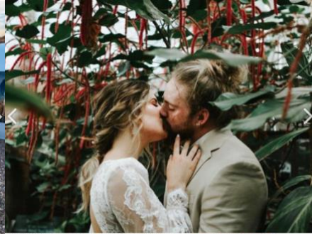
Couples will fall in love with the beautiful, lush surroundings at Amantio Botanical Gardens.