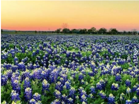
Get out together among the bluebonnets at Fredericksburg's Kisswood Farms. Kisswood Farms