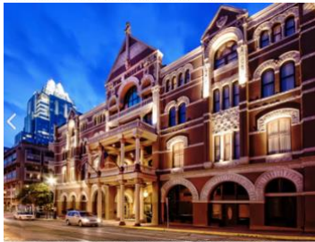
Keep your moonspan simple with a lovely staycation at one of Austin's beloved hotels, like The Driskill.

H oneymoons are about following the rules. Love has rules. They're about getting really stressed: making big sacrifices to get time off, trying to live up to your expectations of the best, most exciting, most romantic thing you could ever think of. They're about blowing a ton of money to celebrate blowing a ton of money. That's it, article over. Go have a traditional honeymoon.