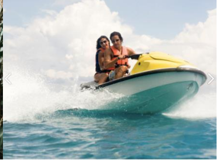
Embrace each other — and adventure — in South Padre. Or just beach out.