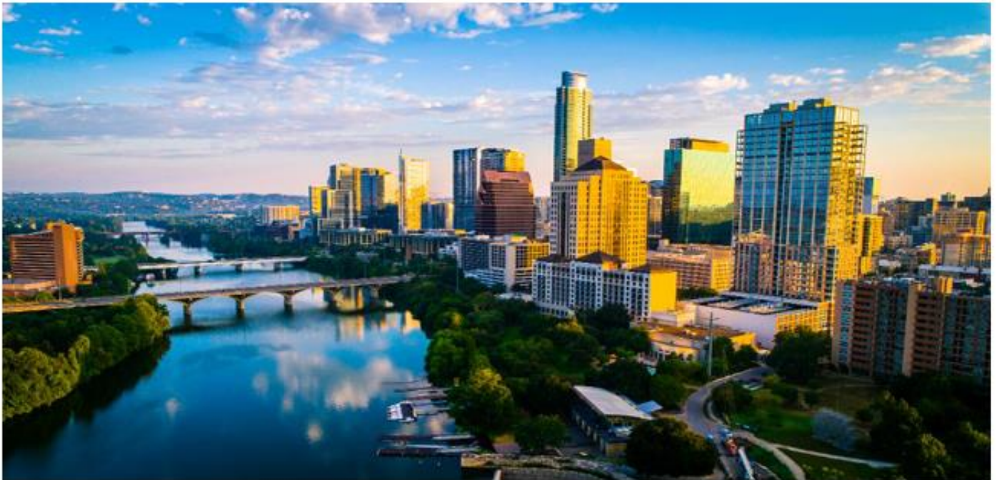
The Austin skyline.

Austin is a city with infinite possibilities—there are so many things to do, foods to eat, cultural experiences to have and places to see that there's no way to fit it all into one trip. Simplify your planning by checking out these hotels in the Texas capital, and free up your time to strategize about how to make it to every barbecue restaurant in town.