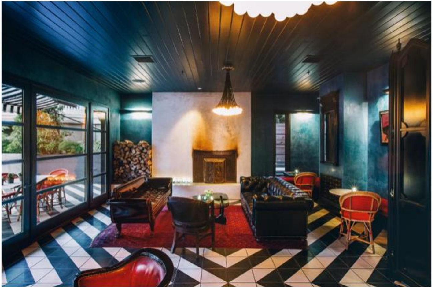
Hotel Saint Cecilia NICK SIMONITE

This chic boutique hotel is an homage to the unique spirit of Austin, and is named after the patron saint of music and poetry. The lobby even has a turntable and an extensive record collection, and there is inspiration from famous thinkers and writers (including Jack Kerouac) all around. There are only five suites, six poolside bungalows and three studios on the property, which is only open to hotel guests.