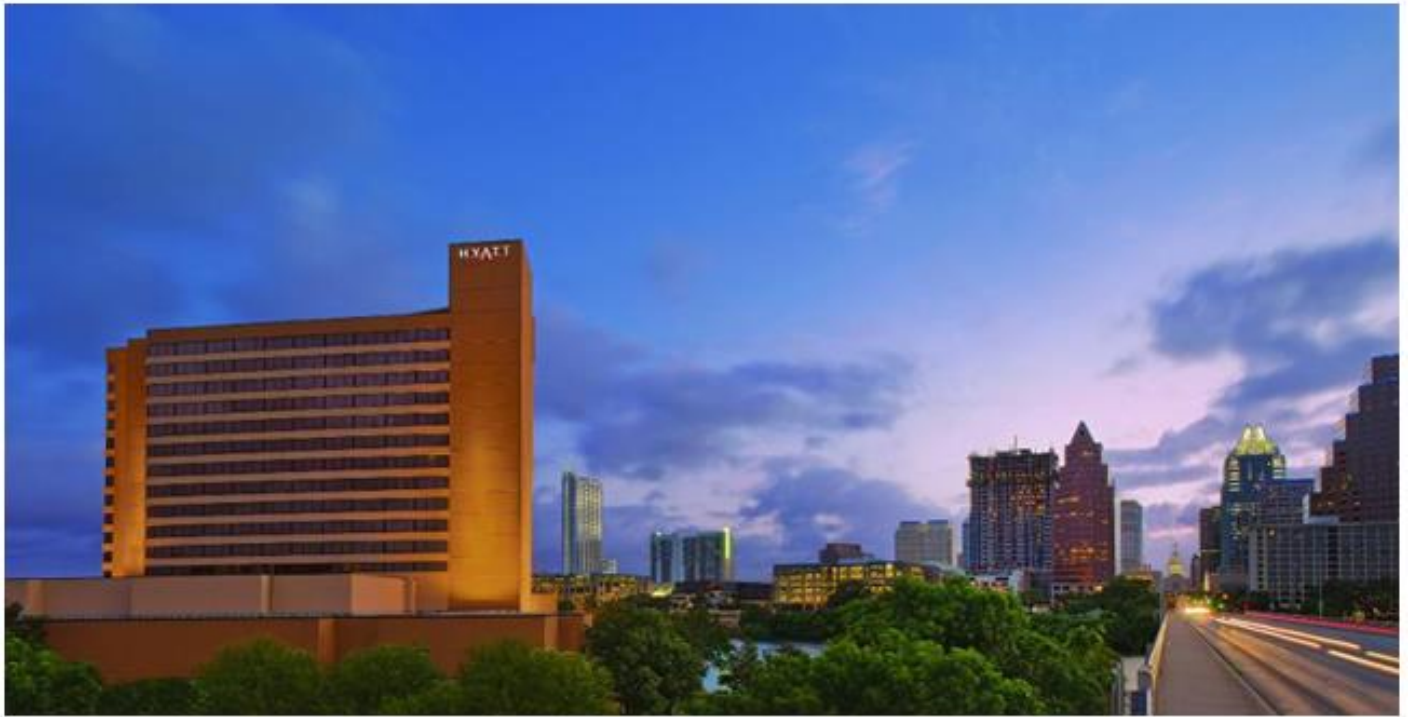
Hyatt Regency Austin

On the shore of Lady Bird Lake, this downtown Austin hotel just underwent a nearly $50 million renovation. It's a five-minute walk to the city's famous Bat Bridge, and to the entertainment on 6th Street. The pet-friendly hotel offers spectacular views of the Austin skyline, from the pool with its Sipping Springs poolside snack bar, from on-site restaurant SWB, which serves Southwestern cuisine, and from Marker 10 Spirits & Cuisine, known for its handcrafted cocktails.