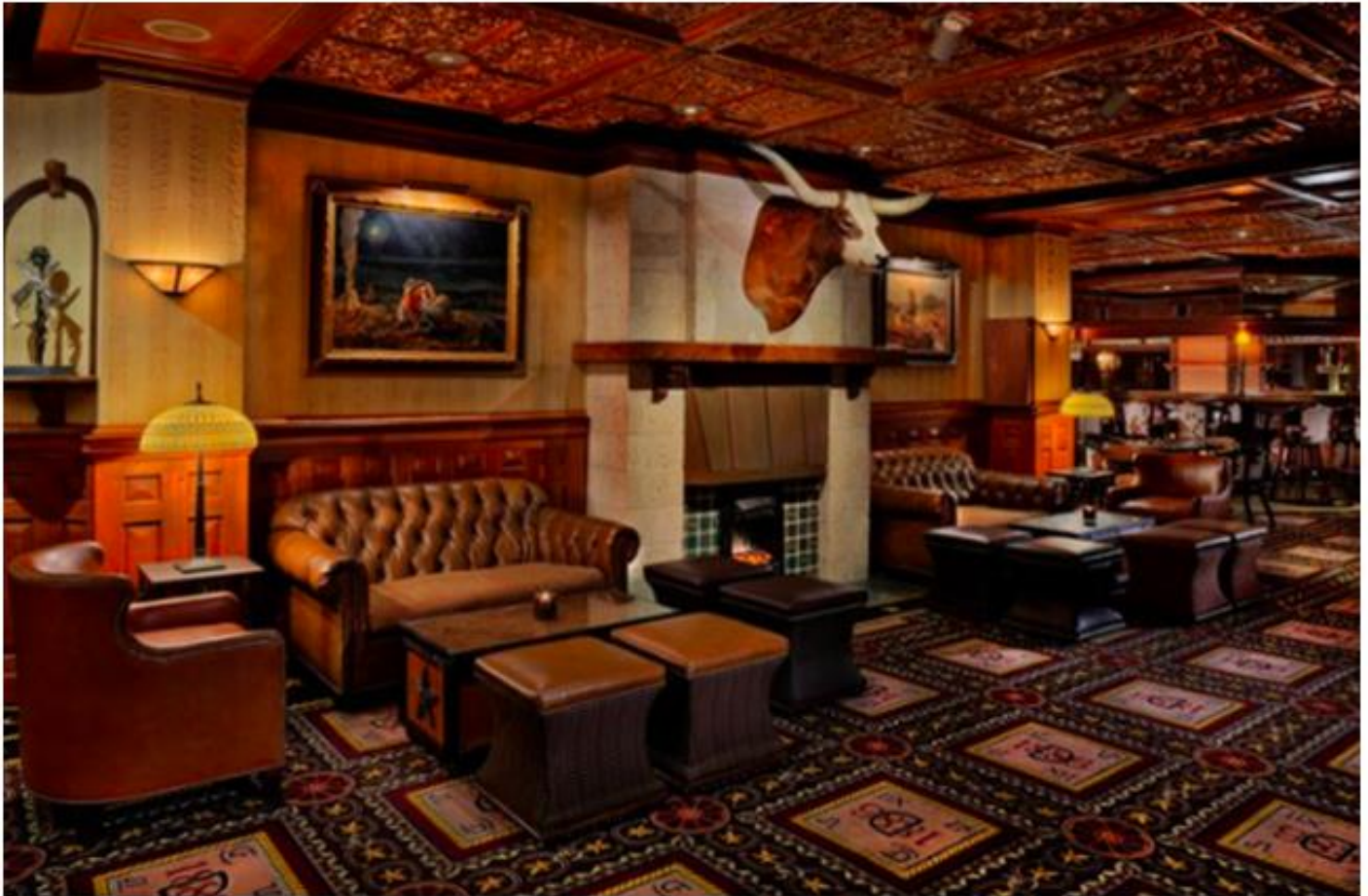
The Driskill

This historic hotel in downtown Austin has been hosting guests for more than 100 years, and has the art, architecture and entertainment to prove that it's an integral part of the city's heritage. The Driskill Bar hosts live music every night, and Antone's is a must-see for its iconic Sunday Blues Happy Hour. The pet-friendly hotel also hosts monthly craft beer dinners and high tea service.